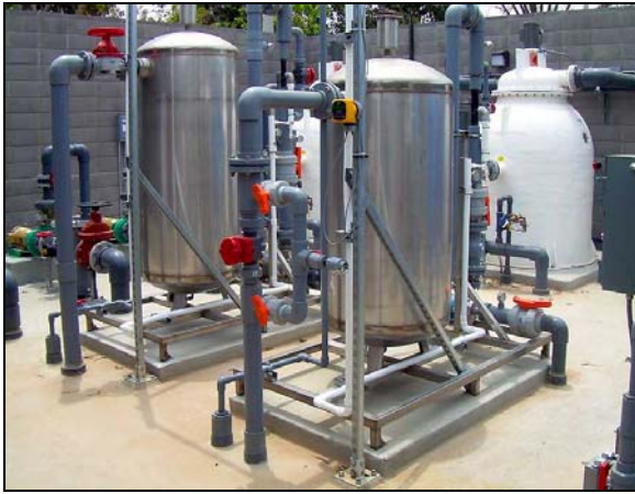
Ozone Contact Tanks Skids