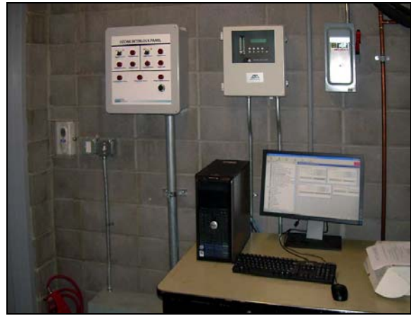
Ozone Monitor & Interlock Safety Panel

ABOUT AMFIL Technologies, Inc. – AMFIL is the manufacturer of cold water ozone-powered cleaning and antimicrobial systems for zoological life support facilities/fish farming, food/food processing equipment, gaseous ozone fumigation systems for produce cold storage and refrigerated transport containers. AMFIL’s products include the mobile mPact-5 and mPact-10 systems, the mPact-25 , mPact-45S , mPact-250S , and mPact-500S centralized systems, mPact-CSF cold storage fumigation system, and mPact-RCF refrigerated container fumigation system. In addition, AMFIL manufactures the mPact-CAS , a system designed specifically for cased meat log cleaning & antimicrobial treatment. Please visit www.amfiltech.com for additional information on mPact™ systems.