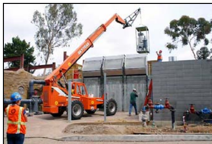
Ozone Gas Decomposer Skid